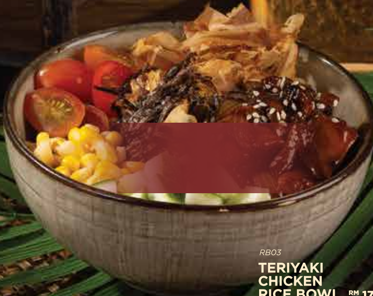
RB03 TERIYAKI CHICKEN RICE BOWL RM 17