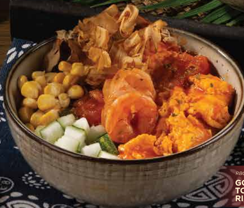
RB04 GOLDEN TOMATO EGG RICE BOWL RM 16