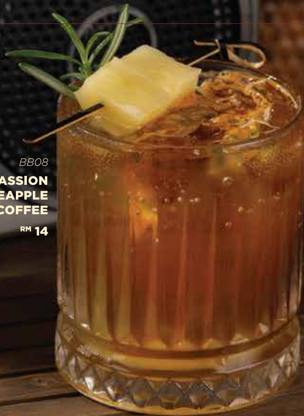
BB08 PASSION PINEAPPLE COFFEE RM 14