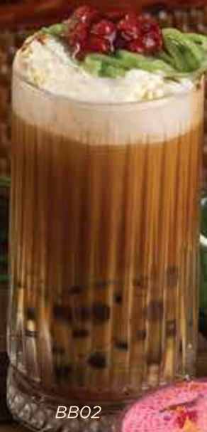
BB02 ROSE BANDUNG LATTE RM 14