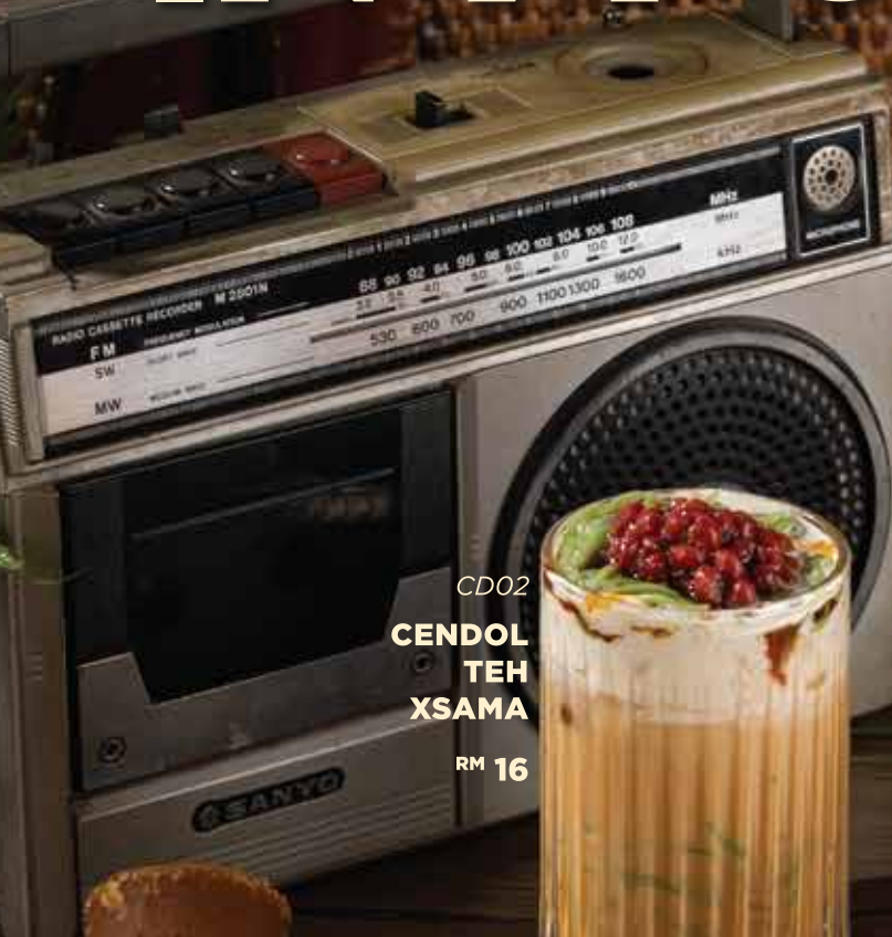
CD02 CENDOL TEH XSAMA RM 16